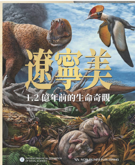
《遼寧美 1.2 億年前的生命奇觀》一書，是遼寧省社會科學界聯合會組織開展的省域品牌敘事研究創新項目系列成果之一，與科學藝術研究和創作機構 PNSO 聯合推出。由遼寧科學技術出版社出版。

未來，遼寧省社科聯計劃通過開展社科研究項目、學術交流與人才培養、國際傳播與推廣等方式，將省域品牌敘事研究及其成果推向世界舞台。港澳地區是遼寧省社科聯省域品牌敘事研究和實踐推廣「走出去」的首選之地，港澳地區與遼寧有着廣泛的經濟社會聯繫，高校及學術機構構建眾多，在國際學術活動和交流上具有獨特優勢。遼寧省社科聯將與港澳地區社科界加強聯繫，尋求開展多方面和多形式的合作，借助港澳舞台，探索省域品牌敘事研究和實踐的世界推廣路徑，講好「遼寧美」等省域品牌故事，為遼寧全面振興注入社科新動力，做出新貢獻。